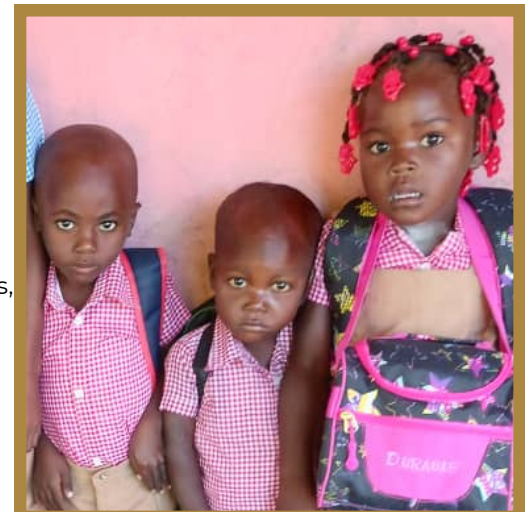
Right: 3 of 6 siblings, ages 3-10, that are all being supported to go to school for the first time